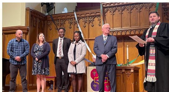
Welcoming new members in 2023.

At Westminster we care about the resources of our people - staff and members/friends, our campus - as we refurbish stained glass windows and prepare for parking lot repairs, and our outreach - assisting the service of dozens of partner organizations with members’ time and financial support through WPC Mission & Outreach Ministry giving.