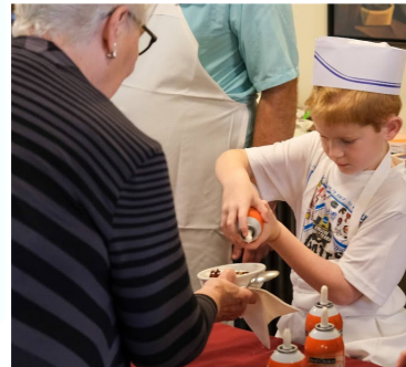
A member of our “Toppings Team” serving at a quarterly “Special Treat” connection time after church.

When we use our time well, we act as good stewards of the gift of our days. You are invited to volunteer hands-on at Westminster or with Westminster service teams as we go and serve with community partner organizations. Please fill out the Time and Talents form, which is one side of the 2024 Pledge Form, and our staff and committees will work to help you get plugged-in.