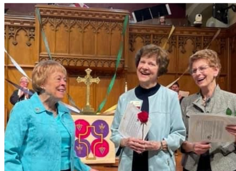
Celebrating our dedicated Food Pantry leaders on “Celebrate the Gifts of Women Sunday 2023”