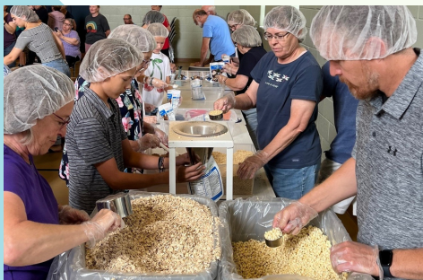
Our first “Service of Service,” packing 10,000 meals for Heartland Kids Against Hunger, was celebrated in the Lincoln Journal Star, 10/11 News, and PC(USA) News Service.