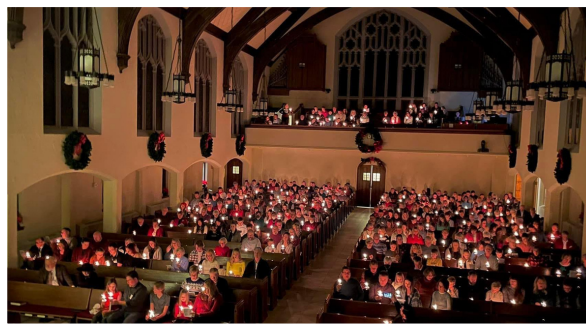
“Silent Night” on Christmas Eve 2022. 2023 Christmas Eve services will be at 5:00 and 7:00pm.