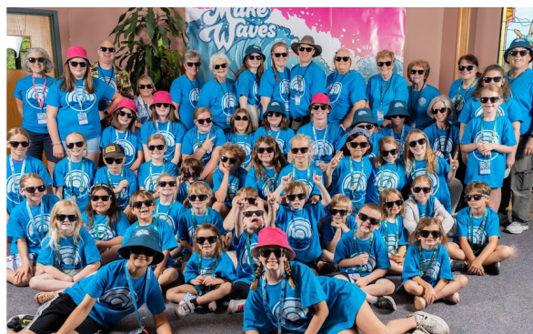
Vacation Bible School 2023 with Good Shepherd Presbyterian. 2024 VBS will be held at WPC June 3-7.