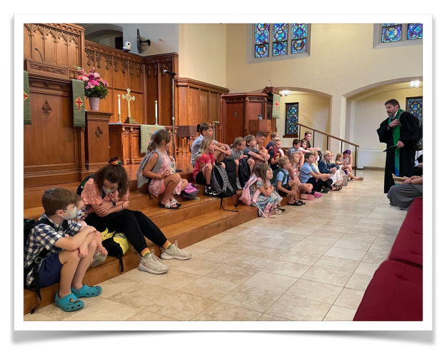
Children's Chat & Blessing of the Backpacks