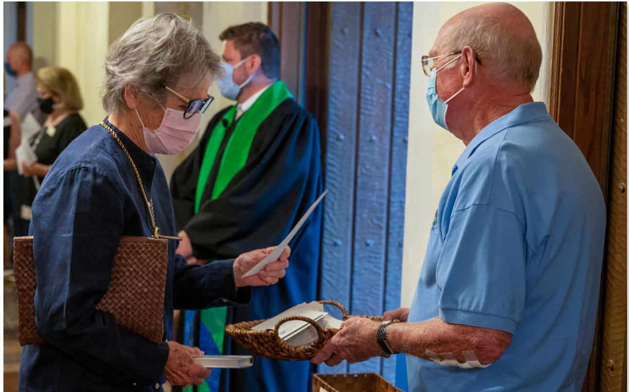
Reverse Offering, Sunday Sept. 12, 2021. See page 9.