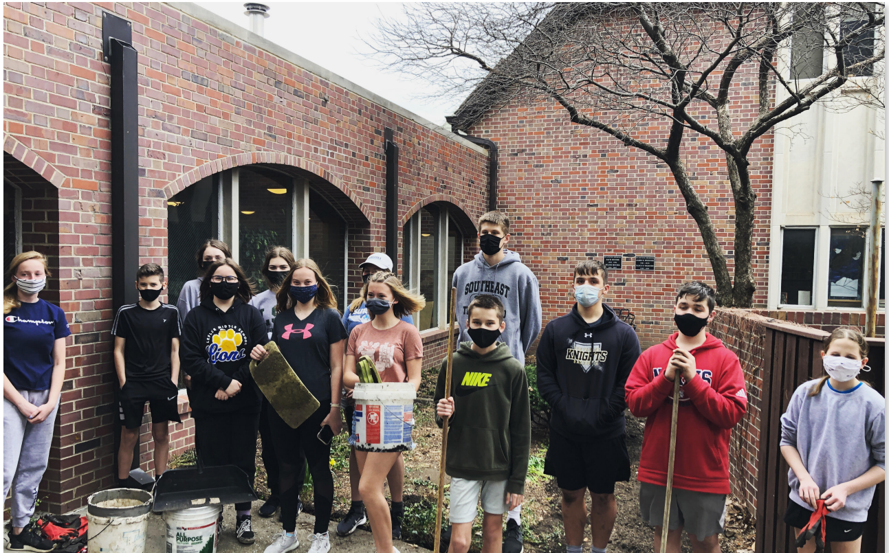
Photo: Youth of WPC gather to help clean up the Prayer Garden