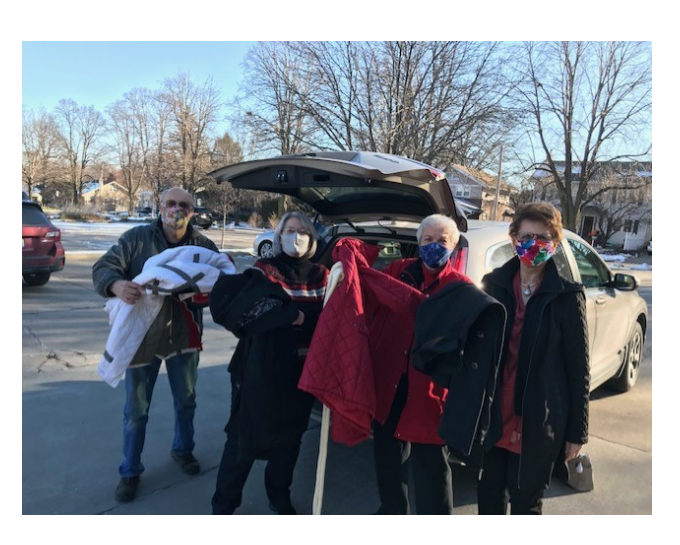
Mission and Outreach members helping with the Winter Coat, Hat & Glove Drive