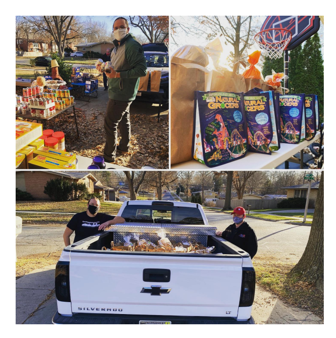
Some of the Care Packages for the Quarantined distribution.

Styrofoam packaging and broken string lights are now being collected at Westminster for recycling. We can't accept disposable food containers or packing peanuts. Together we can keep piles of wire and white stuff out of the landfill.