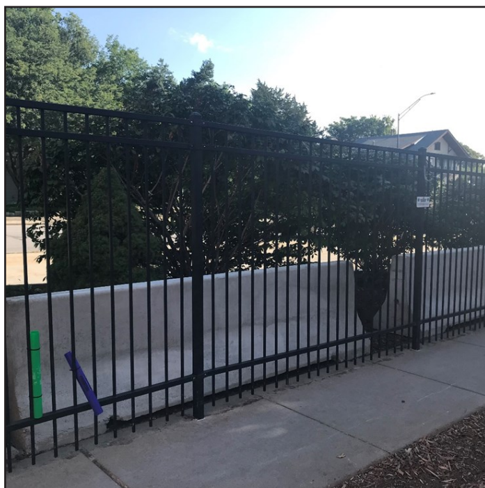
Concrete barriers on north side of playground.

Westminster Preschool is so fortunate to have the support of Westminster Presbyterian's Building and Grounds Committee to ensure the children that attend Westminster Preschool are kept safe! The Building and Grounds Committee researched, purchased, and installed safety barriers on the north side of the preschool playground to prevent any opportunity for traffic to impact the playground. While Building and Grounds headed up this project, Steve Larson took a personal interest and spent countless hours researching and investigating the best and most cost efficient solution. For days leading up to the delivery of the concrete barriers Steve could be found digging trenches and clearing the spaces, preparing for the install. Steve organized the installation and oversaw the project from start to finish. Westminster preschool is grateful for Steve and the entire Building and Grounds Committee.