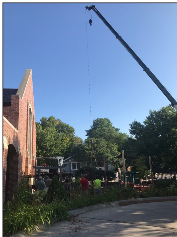
Installation of the barriers.