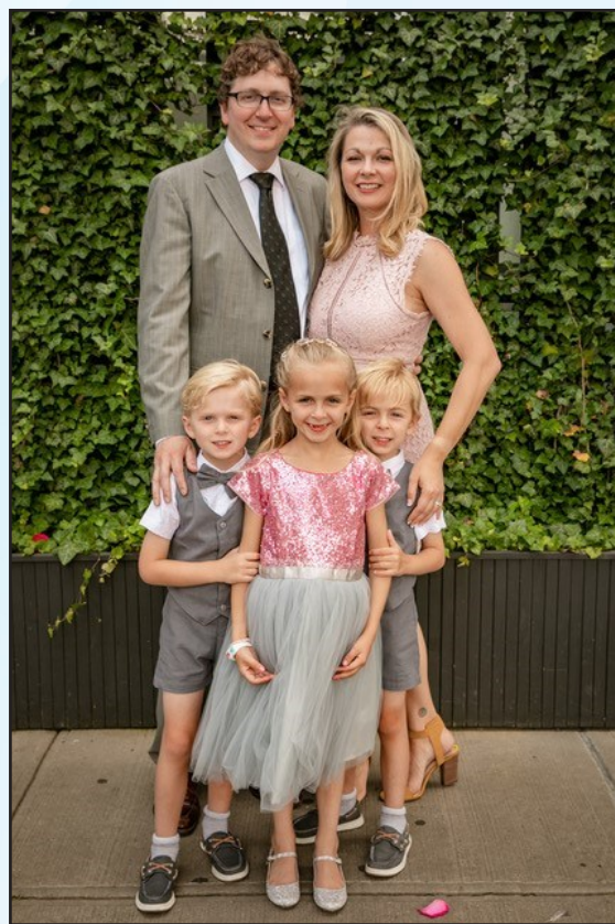
2019 Attending a wedding

The "immersive experience" in Presbyterianism was positive; she went on to teach Sunday School for two years in the Kindergarten of Eden when her boys were in attendance.