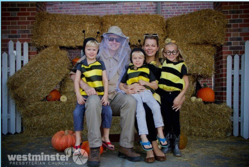
Westminster "Spooktacular" Event