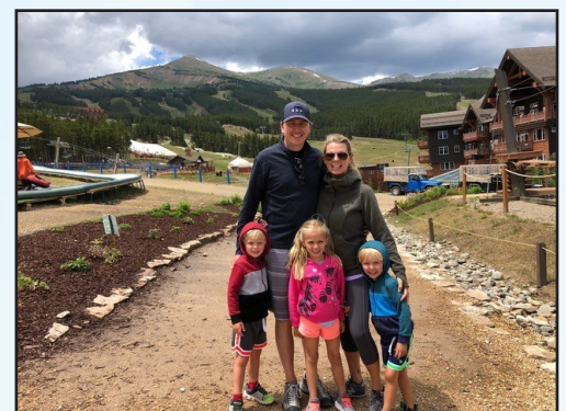
Family vacation in Colorado