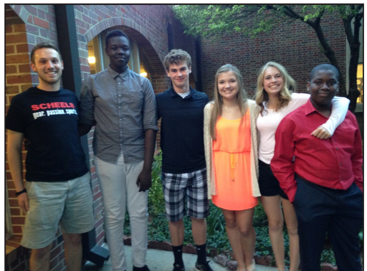
Confirmation Kids Spring 2016