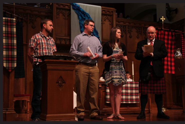
New Members Spring 2016

The New Member Ministry set ambitious goals for 2016 and made progress in a number of key areas. We hosted six of the Journeying Together new member information classes and welcomed 44 new members into our church family this year. Membership stands at 1265 as of December 31st.