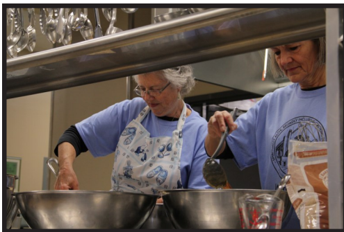
Matt Talbot Kitchen