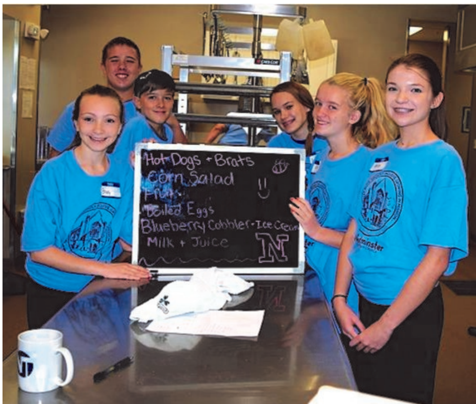
Westminster confirmands helped out at Matt Talbot Kitchen during Neighbors Helping Neighbors on October 11.

The dates have been set for our youth trip to Germany and it's time to reserve your space! Join us for an informational discussion of the trip, costs and potential fundraising on Sunday, November 9, at 11:45 a.m. in the Parlor. Feel free to grab a plate of 2nd Sunday lunch and bring it with you!