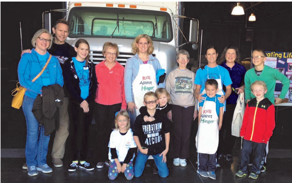
Westminster members volunteered at Kids Against Hunger as part of a Lincoln-wide outreach effort Neighbors Helping Neighbors on October 11.

Please consider joining our Over the Road team, even as an occasional driver! For more information or to volunteer, contact Dan King at (402) 480-6213 or dannythek@gmail.com.