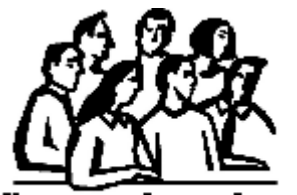
New members class

Westminster is a church that is spiritually alive, broadly inclusive, and growing in mission. If you are interested in exploring membership at Westminster, please join us in the lounge at 9:00 am today.